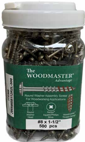
Each jar includes a FREE bit